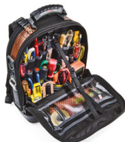
AX3502 TECH PAC LT