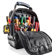
AX3513 TECH MCT