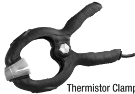
Thermistor Clamp (#MDTCLMP-A1)