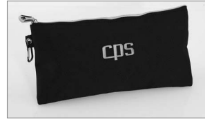
Canvas Storage Case (#50-128)